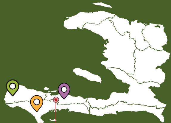
Epicenter of magnitude 7.2 earthquake